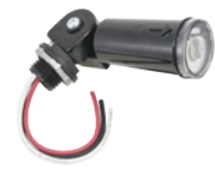
PC-120 (120V AC) PC-277 (208-277V AC) Dusk to dawn pencil photocell for 1/2" NPS hole