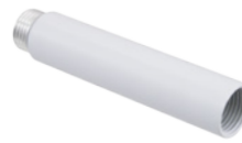
AL-4C-WH 4" extension arm (White)