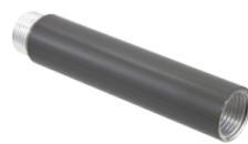
AL-4C-DB 4" extension arm (Dark Bronze)