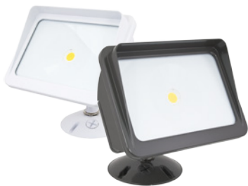
ALV2-30WF-DB (Dark Bronze) ALV2-30WF-WH (White) Panorama Sunset 30 3000K / 30W / 2376Lm